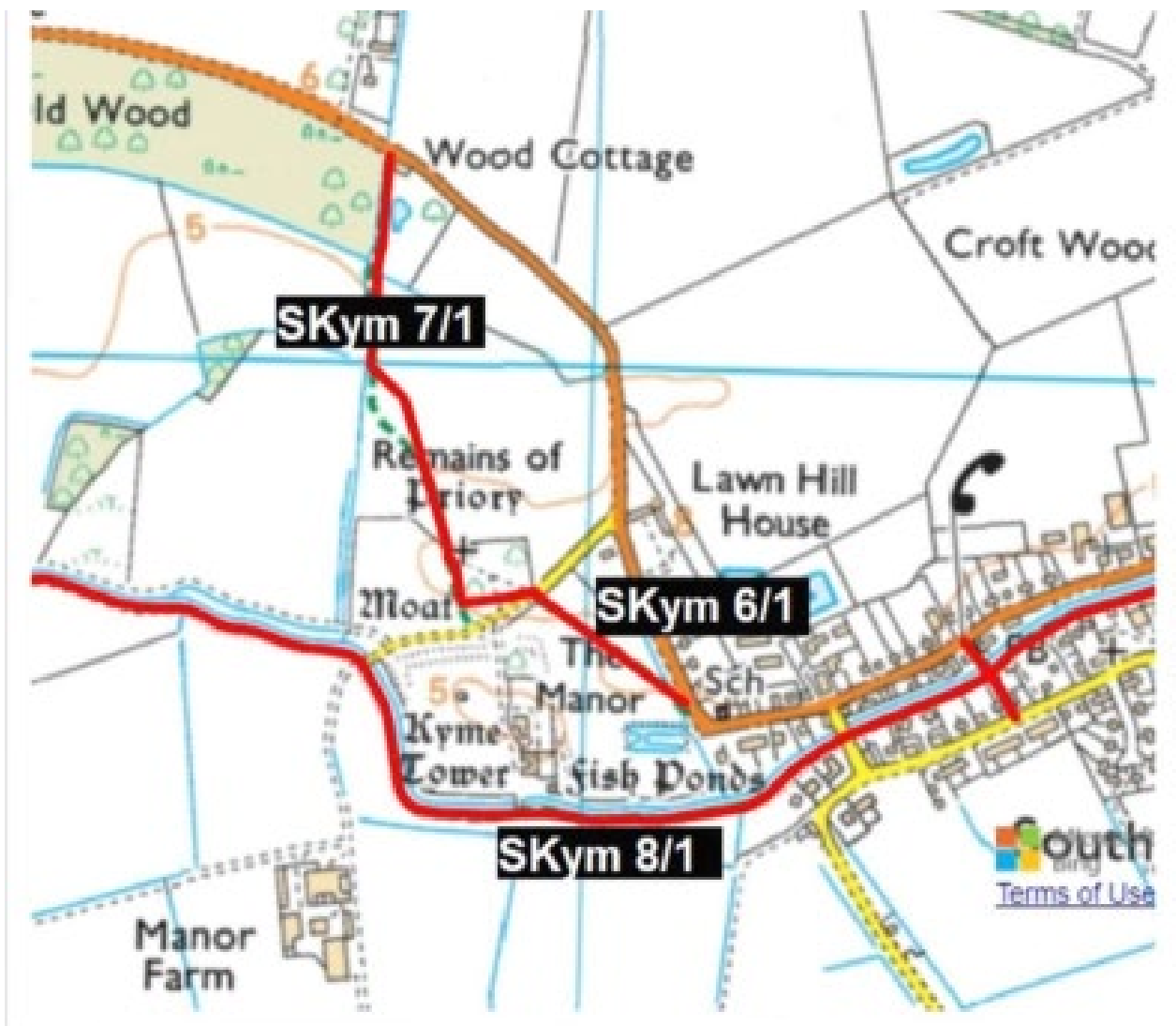
Public Rights of Way [Figure 2, REP3-001]